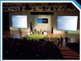
New spaces for success Where professionals come together