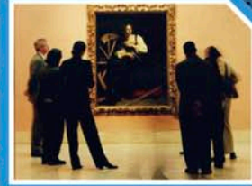
The Walk of Art A private visit to a unique collection